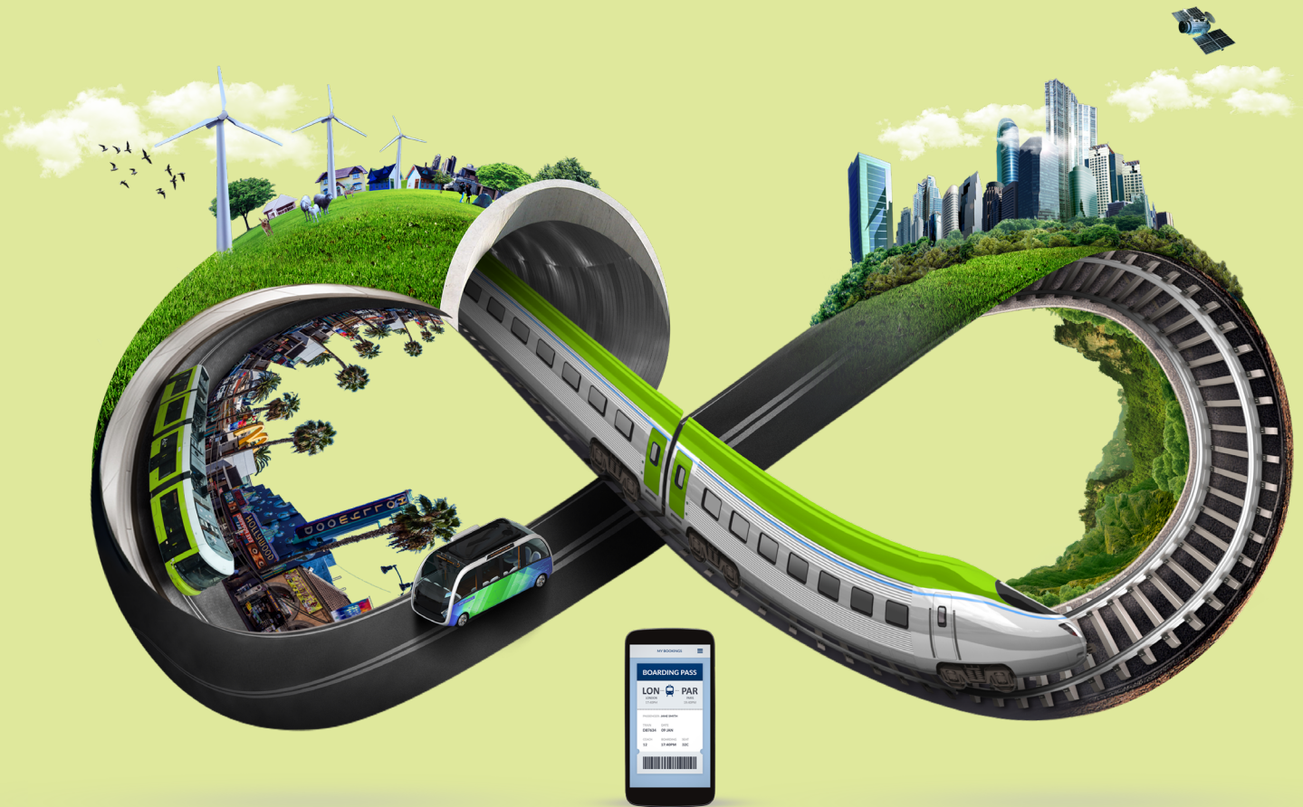
Figure 3. Multimodal Environment-Friendly Transport

Greener journeys are typically multimodal in character. As travellers become less reliant on a single mode of transport, the ability to enable integrated journeys using multiple modes is going to become increasingly important. Rail provides a natural focal point for mobility in its widest sense: stations have the capacity to serve as hubs for multiple modes of transport, including buses and trams, as well as offering facilities to support e-mobility, from vehicle charging to bike sharing.